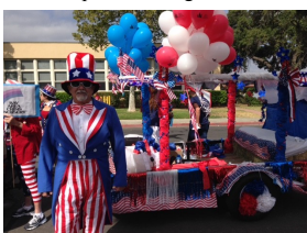
Uncle Sam and Bay Area Crisis Nursery