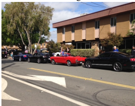
Lined up and waiting