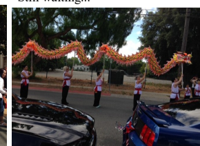
Just a little dragon waiting for his que