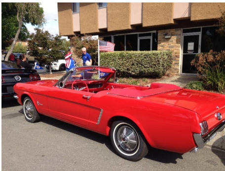
Ed Guldner's Rangoon Red 1965 convertible

“Red White and Blue” done Mustang-style!