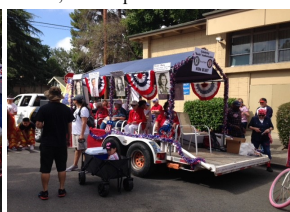
Rosie the Riveter and WWII vet and Jeep...our honored past.....