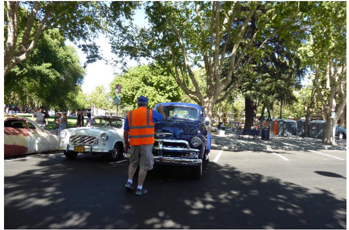
Is Harry backing up or is the car backing up?