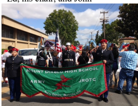
...and our bright future!!